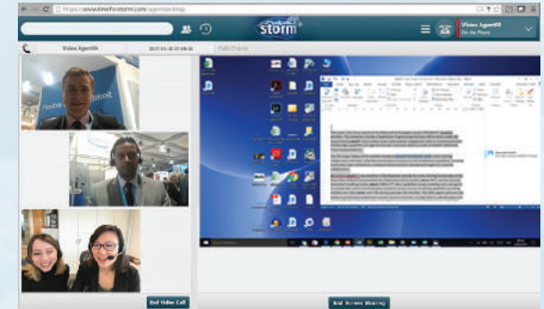
Multiple live video streams and desktop sharing via WebRTC integration in a single agent desktop

Content Guru demonstrated the first integration of WebRTC technology with contact centre capabilities, a feature which has been continually developed to include multi-party video chat and advanced collaboration (see right within the Desktop Task Assistant agent interface).